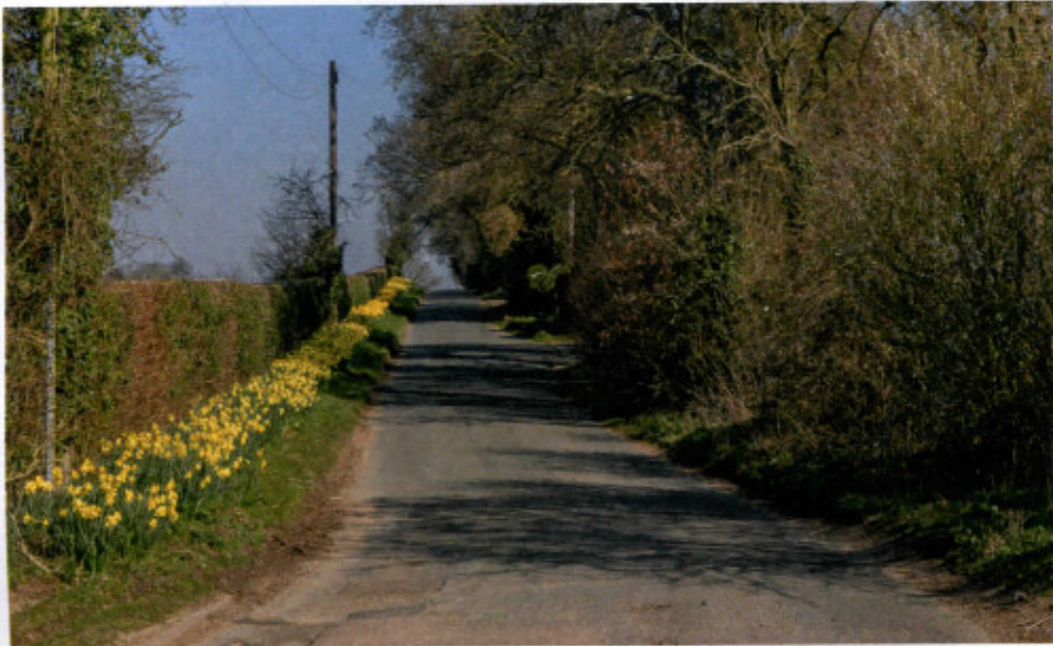
New Road Looking North