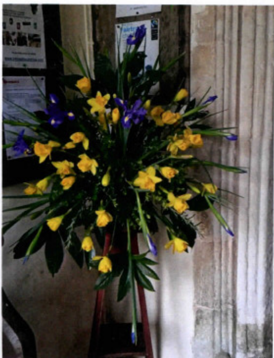
Flowers at the Vigil for Ukraine