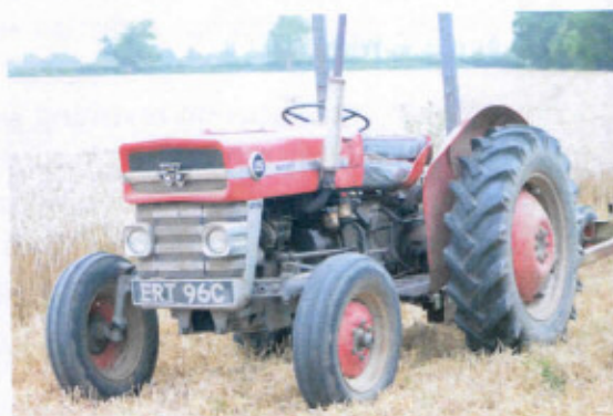
These images were Lionel's pride and joy

The allotment plot starts in earnest on the 1 st day of April, ideally the 1 st March weather permitting, when the plot has to be cultivated and dug over, the race is then on to get the vegetables and seeds set, before the lightly hood of droughts taking hold. The first thing to set are the broad beans and onion sets, plus shallots. My favourite variety of bean is Aquadulce, the classic variety for Autumn sowing, they withstand the worst of Winter weather to give an early crop, then sow again in Spring to get a second crop and get the best of both worlds. Bunyards Exhibition is another good variety. Onion sets are marble size in which you grow them on until they reach cricket ball size – takes 3 to 4 months, then lift and dry them, tie them up into bunches and hang them up in your shed or garage, they keep very well and can be used throughout the year until next Spring. French and Runner beans can go in once the danger of frost is over. You can grow them now in pots and keep them undercover in the greenhouse until it is safe to set them outside.