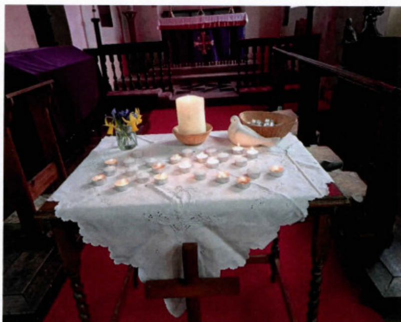
Candles at the Vigil for Ukraine