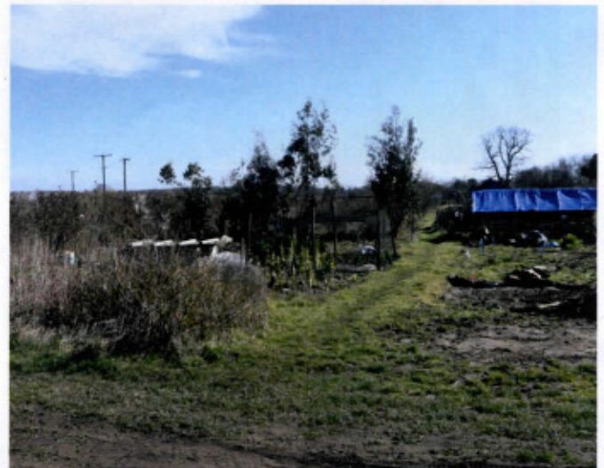
2 views of Tostock allotments

One of the advantages of renting an allotment plot here is that we are so lucky to have such a very good Flower and Vegetable Show at our village hall once a year usually in early September, run by Barney and Julie and their organisers, which has run now for over 30 years in which it is all good fun competing against each other trying to win classes, with well over 60 classes in all to win silverware and trophies, awarded to the entrants who gain the most overall points.